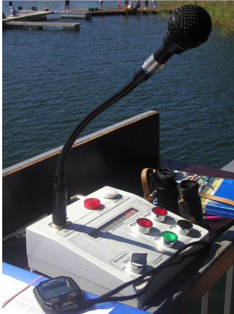
A traffic light control console at a FISA event